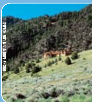
ROCKY MOUNTAIN LOG HOMES

• Water accessibility in particularly hilly areas can be very deceptive. "Your neighbors can have a 200-foot well and you can have a dry hole to the fault line," says Petri. "Talk to a local well driller and ask about the property." Make sure the property has room for a septic system and drain field to meet building codes.