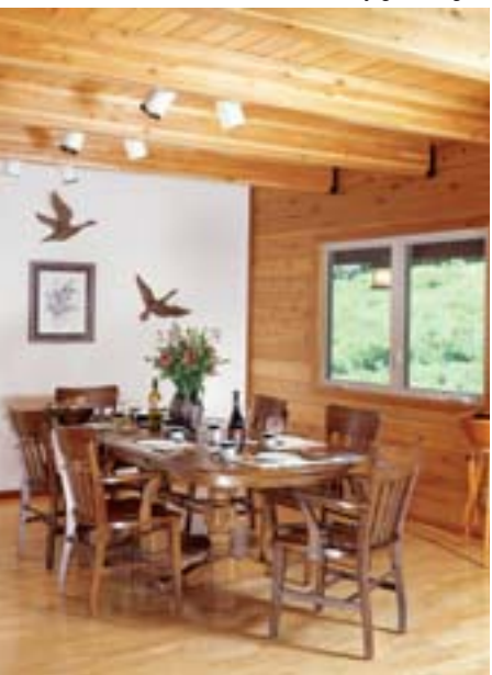
BELOW: Dining with the Cichellis usually involves a crowd. The spacious dining room can easily accommodate a large social dinner party or family gathering.