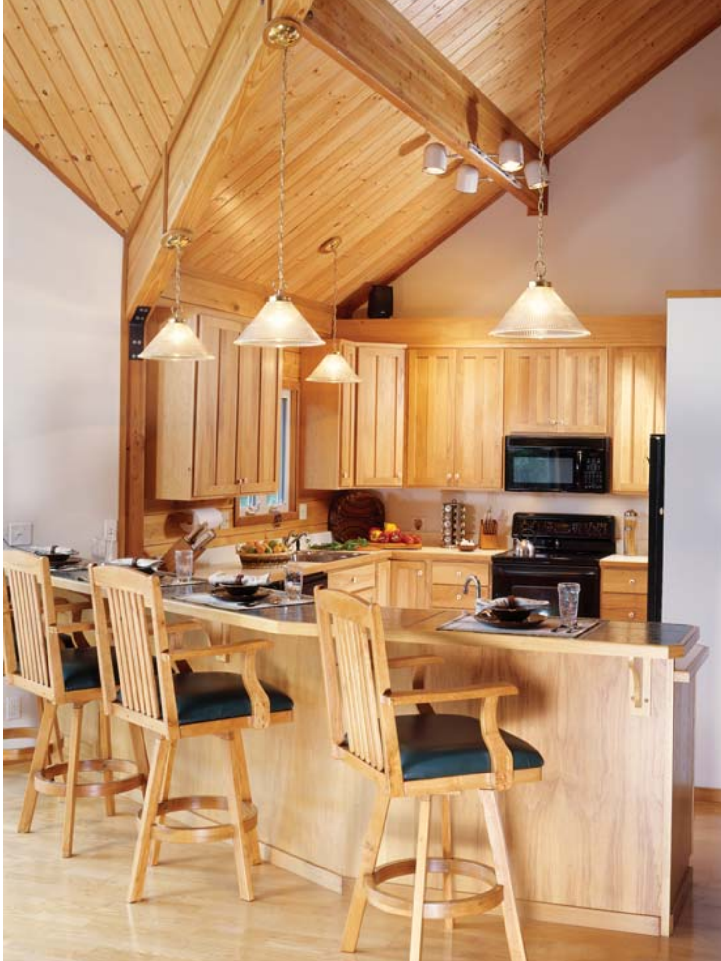
RIGHT: The kitchen is one of Martha's favorite rooms in the house. It features plenty of space to cook for a crew, natural light streaming in through picture windows, a two-tiered counter, and an open plan to stay in contact with the guests.