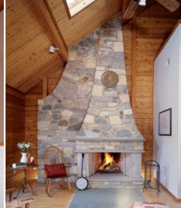
LEFT: The master bedroom fireplace is the back half of the two-sided great room fireplace. This structural work of art was created by a local mason, who used local stone. BELOW: Smart tile work brings a splash of color into the master bath.